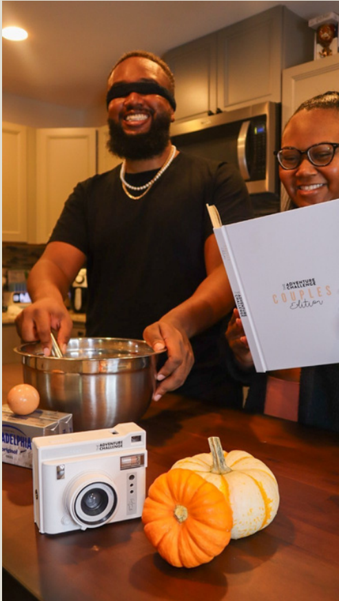
REEL: THE ADVENTURE CHALLENGE PAID POST

CLICK THE IMAGES BELOW TO VIEW SOME OF MY PREVIOUS WORK