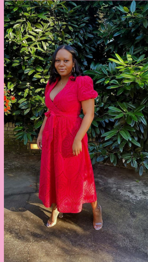
CAROUSEL: RENT THE RUNWAY PAID POST