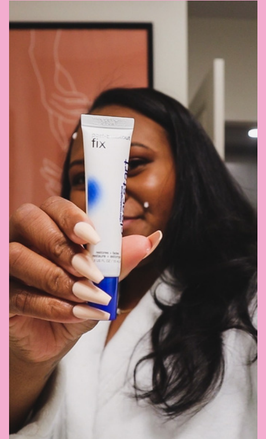
REEL: DERMALOGICA X CLEAR START PAID POST