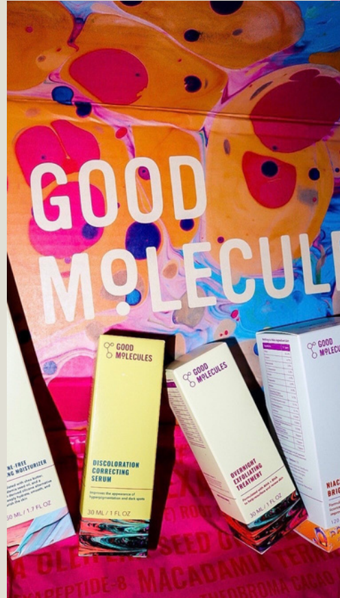
REEL: GOOD MOLECULES PR GIFT UNBOXING